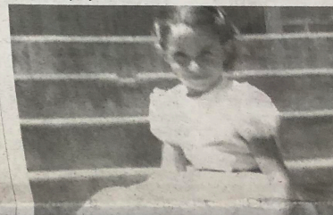
A young girl on the steps of John Sevier Elementary from the late 1950's. The first person who call's 1 (865)579-8264, ext 5, with her identity will win two 'Four Dots and a Dash' Doo Wop group, singing in the 50's and 60's. The group is made up of Knox School Personnel.

generously donated to the Museum by members of our community. The Museum's collection of historical information, artifacts and memorabilia on John Sevier, Mascot, Skaggs, Arminda, Clear Springs Schools as well as East Knox County Elementary School is somewhat lacking. We are reaching out to the members of each of those communities who may have items pertaining to those schools who would want to donate those items to the Museum. That would allow those items, instead of being lost stored away somewhere, to have a permanent home to be displayed for others to enjoy. The Museum is open Monday, 11 am - 4 pm. Please visit.....and bring your items to be donated.